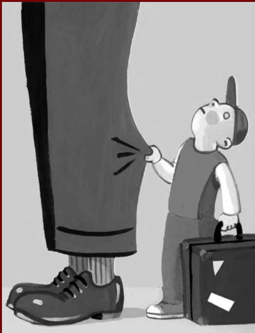
ILLUSTRATION: ALISON SELPER